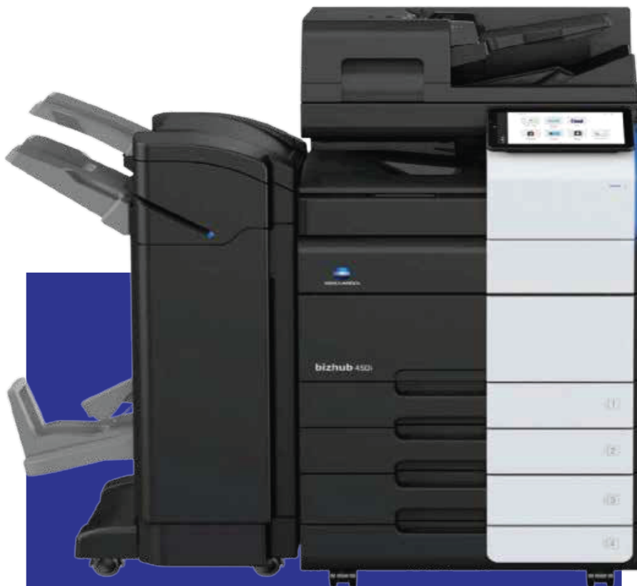
Konica Minolta bizhub (new demo) 450i (45 ppm)