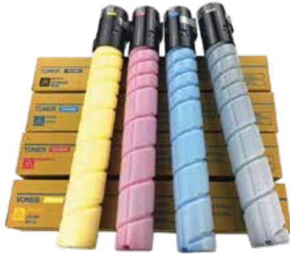
MINOLTA TONER CARTRIDGES