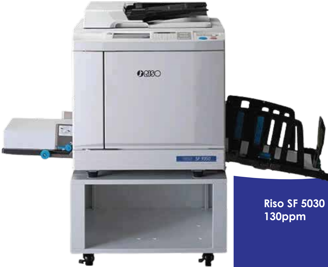
Riso SF 5030 (New) 130ppm