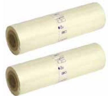
MASTER (ORIGINAL ONLY)