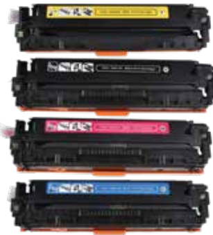
TOSHIBA TONER CARTRIDGES