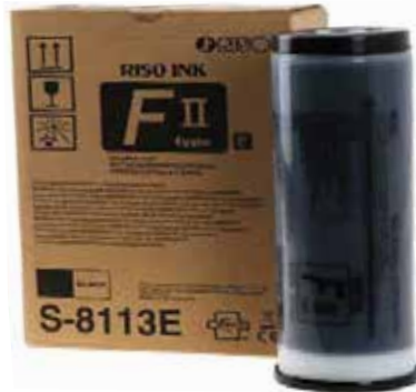
INK (ORIGINAL ONLY)