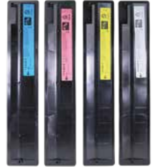
CANON TONER CARTRIDGES