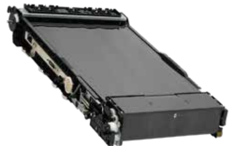
MINOLTA TRANFER BELT