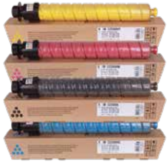
RICO TONER CARTRIDGES