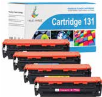
HP TONER CARTRIDGES